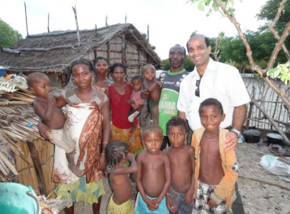
Family of Fishermen

We visited a family of fishermen. It was heart breaking to see the way this family lived in a hut by the shore. They were drying fish on a fire. Their only means of making a little money is selling a few fish they are able to catch and they live in absolute poverty. They let us see their one- room home when I asked. It had one bed and a cooking area in the corner. I was told that everyone sleeps on the floor. They begged for money for taking a picture with them. Of course we shared a little bit but what good is a little for a family of more than ten members?! How could I take God's many blessings for me for granted?